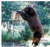
This bear, caught raiding bird feeders and eating home owners'...

slaughtered 17. He didn't eat all of them. He wreaked havoc."